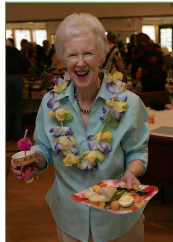
Holiday celebrations of all kinds are hosted at FTJ