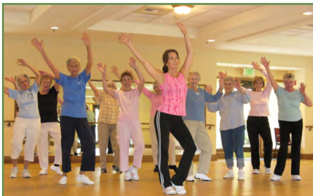
FTJ Zumba Class