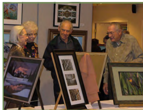
FTJ Annual Senior Art Show