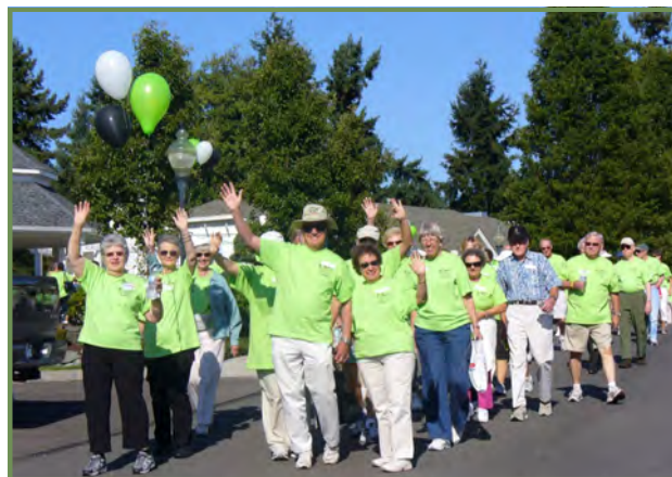
Annual FTJ Wellness Walk