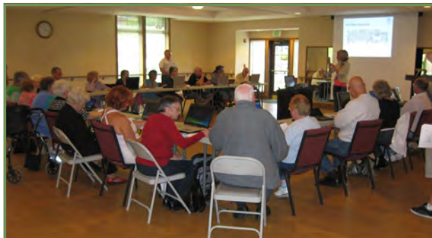
FTJ Senior University Computer Class