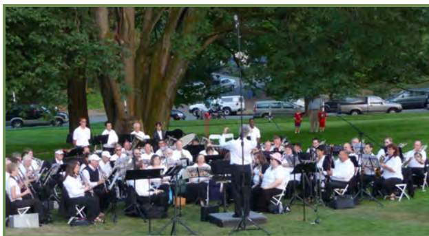
Summer Concerts on the Lawn