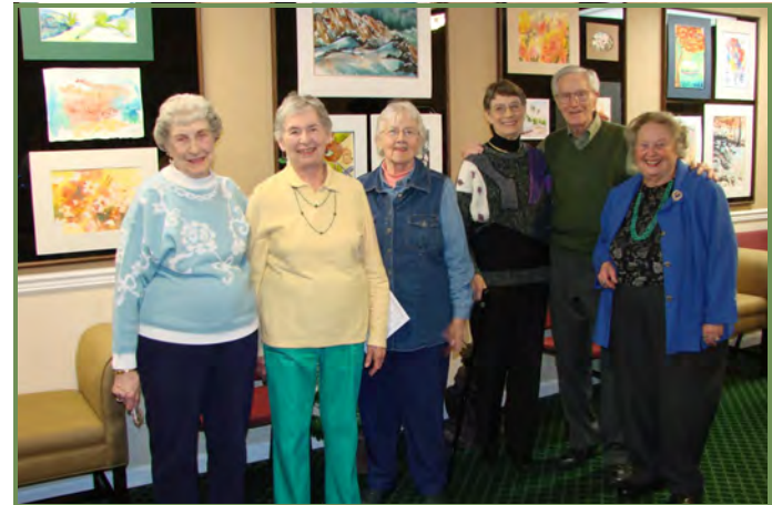
Resident Art Gallery