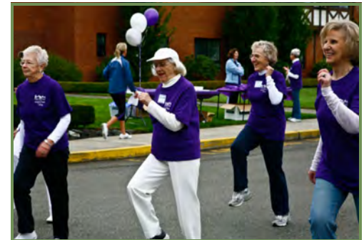
Annual Wellness Walk and Fair