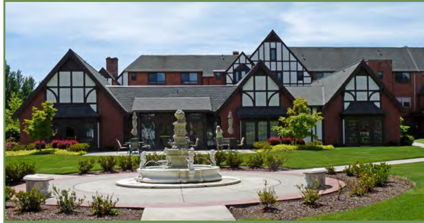
The fabulous MJ Wicks Wellness/Fitness Center is in the Lillian Pratt Building