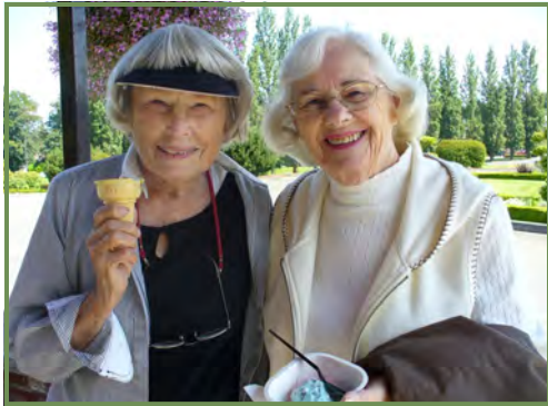
Summer Ice Cream Socials at Lillian Pratt