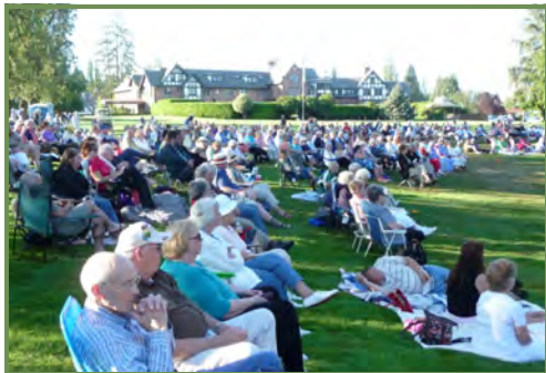
Summer Concerts on the Lawn