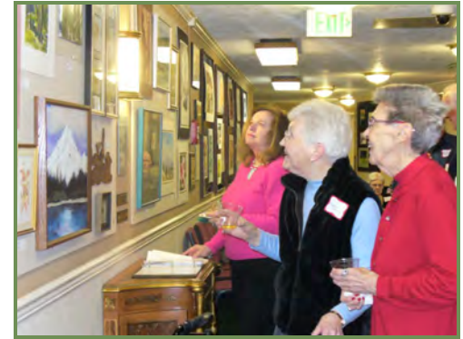
Resident Art Gallery In Lillian Pratt