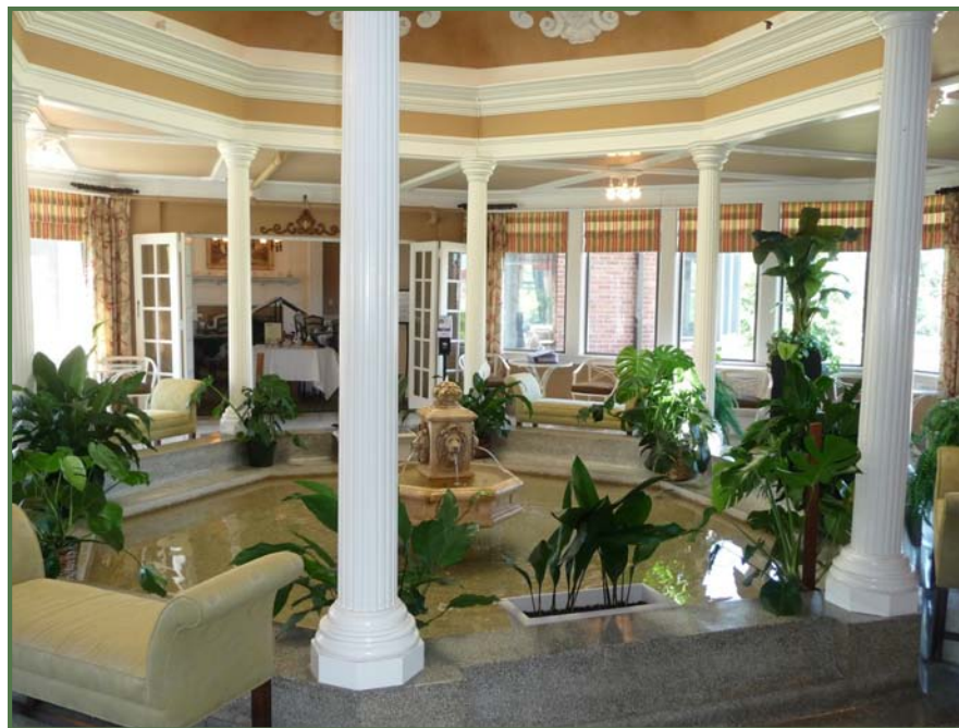
Tobey Jones Solarium