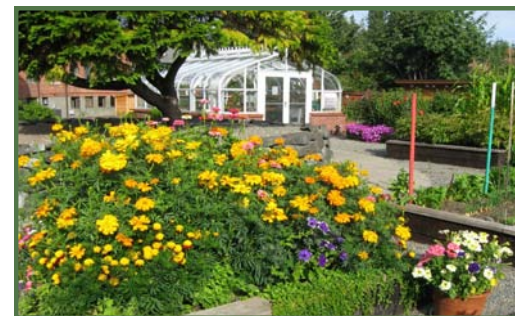
Resident Garden and Greenhouse