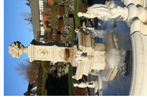
FTJ Frozen Fountain

To enrich and extend the quality of life for seniors in our community. As a not-for-profit organization, we provide senior residential services, a supportive continuum of care, and innovative community outreach.