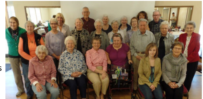
2016 Volunteer Awardees

On April 6th, in part to celebrate National Volunteer Month, Franke Tobey Jones hosted our annual Donor and Volunteer Appreciation Party. Donors and volunteers were thanked for their generous gifts of time and financial resources to support seniors living at Franke Tobey Jones and in our local community.