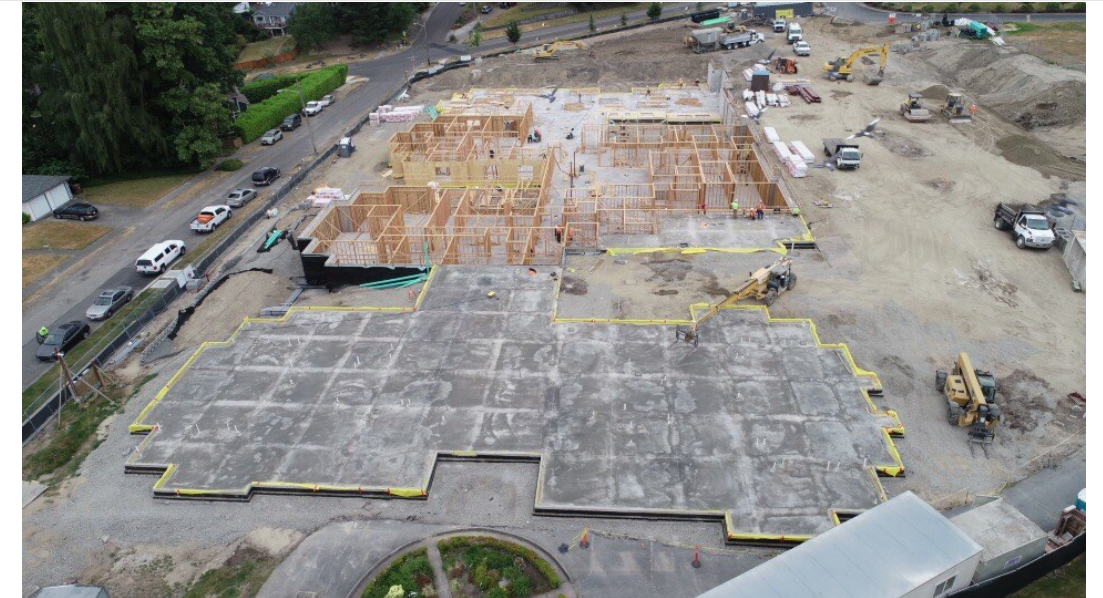
New Health Care / Memory Care building being constructed

If you would like your name removed from our mailing list, please call our main reception desk at (253) 752-6621