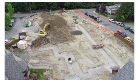
Bristol View Apartment Site

We are also in the process of updating our Lillian Pratt building. The painters have finished, and we are now carpeting. Next will be new furniture and fixtures.