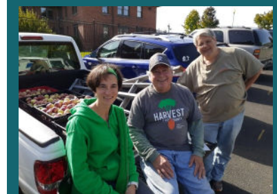
Thank you to Harvest Pierce County volunteers.

Do you have fruit trees that need harvesting for a good cause? Call Harvest Pierce County! 253-845-9770. To learn more visit: PierceCounty-GleaningProject.org