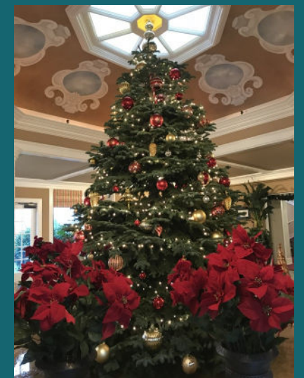
Christmas Tree in the FTJ Tobey Jones building Solarium

From our family to yours—Happy Holidays. May 2020 be a joyful, meaningful and fulfilling year for you and your loved ones!