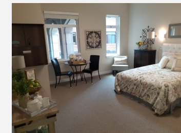
Memory Care Resident Room