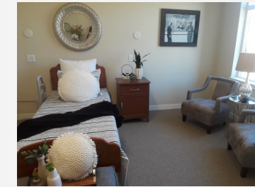
Skilled Nursing Resident Room