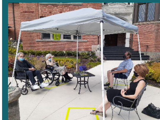
Family Outdoor Visit

We are open for outdoor and window visits for Skilled Nursing, Memory Care and Assisted Living residents/family members. FTJ has designated areas for residents and families to visit through the window when the weather is not cooperating for outdoor visits. These areas offer privacy and social distancing. There are some visitation areas that are covered for families to stay out of the elements. We are following the DOH Outdoor/Window Visitation Guidance document which is subject to change. If you would like to visit a loved one in any of our care areas, please call 253-752-6621 to make a reservation. While making your reservation, please ask for the guidelines. If your loved one lives in independent living, you do not need a reservation to make an outside or window visit. We are also still offering virtual meetings as well.