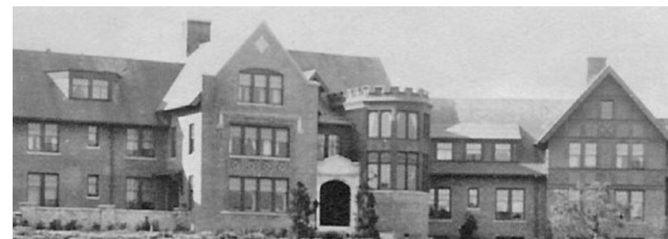
Franke Tobey Jones Original Building Circa 1925