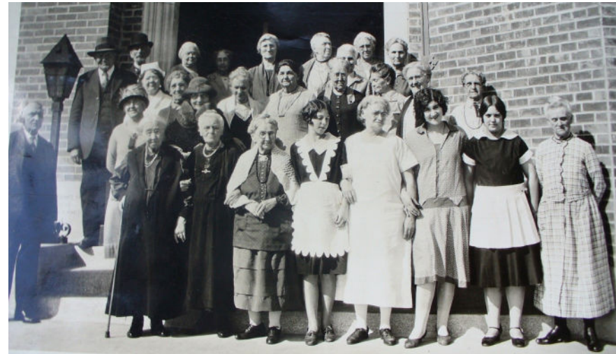
Franke Tobey Jones Residents and Staff Circa 1925