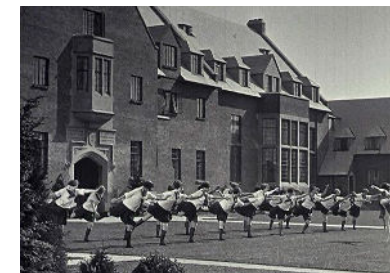
Annie Wright Seminary 1920s.