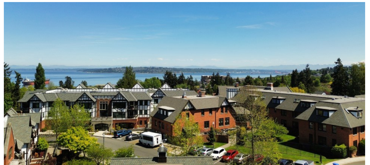
Views from the Parkside View Rooftop Gathering Deck