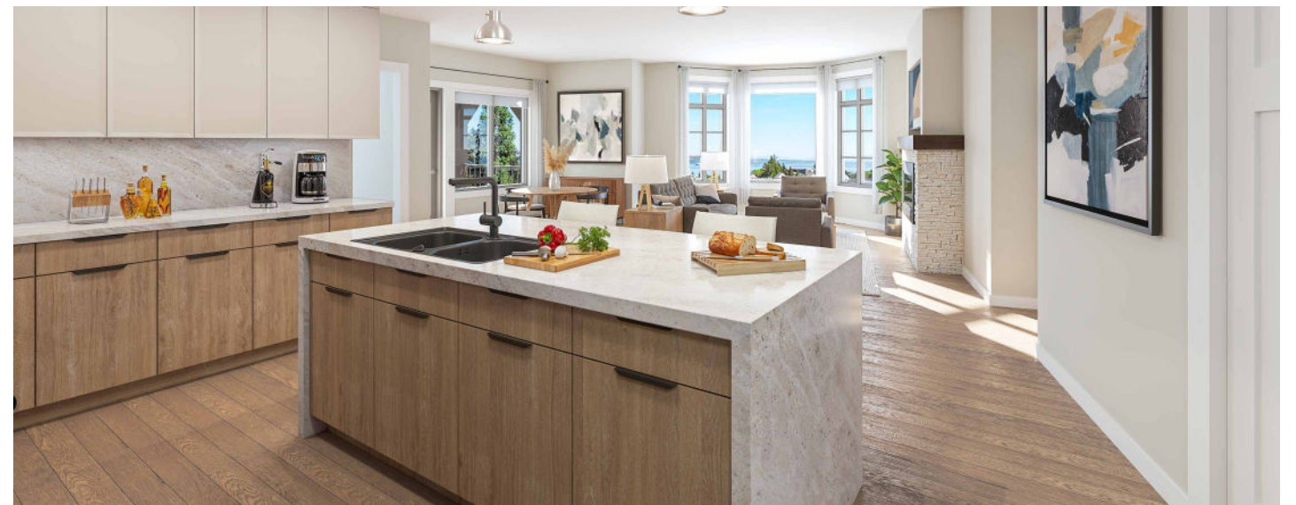
Parkside View Interior Image